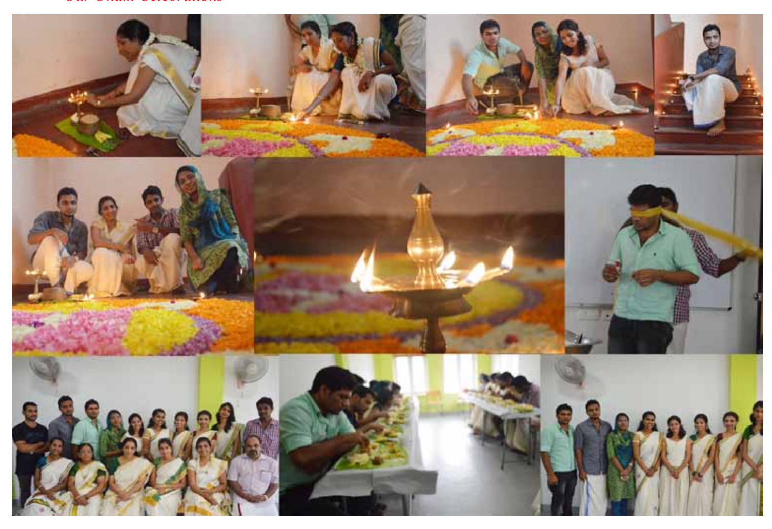
Our Onam Celebrations